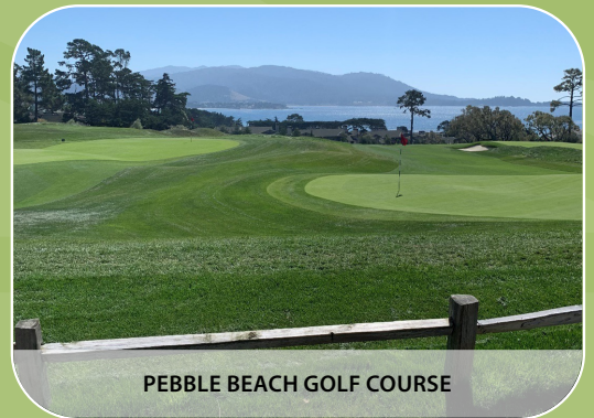
PEBBLE BEACH GOLF COURSE