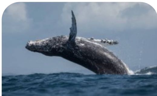
WHALE WATCHING, MONTEREY BAY