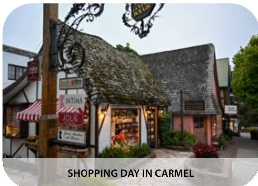
SHOPPING DAY IN CARMEL