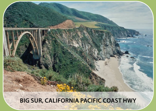
BIG SUR, CALIFORNIA PACIFIC COAST HWY