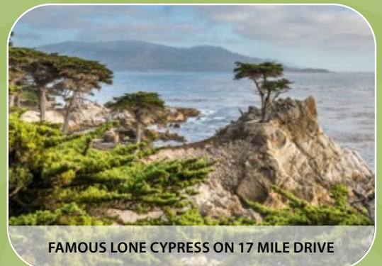
FAMOUS LONE CYPRESS ON 17 MILE DRIVE