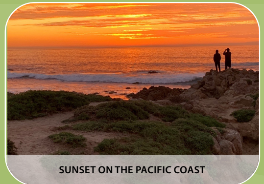
SUNSET ON THE PACIFIC COAST